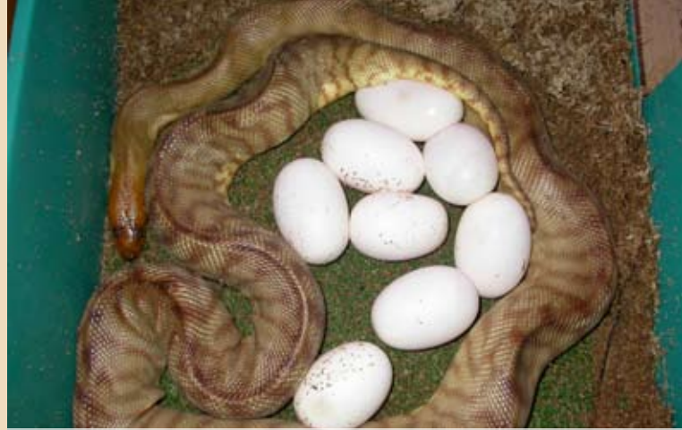
A female Tanami woma lays her clutch of eggs loosely and then gathers them together for incubation. Notice we use artificial turf because the eggs won't stick to it.

we decide to separate them a couple of days later it is usually in the late morning.