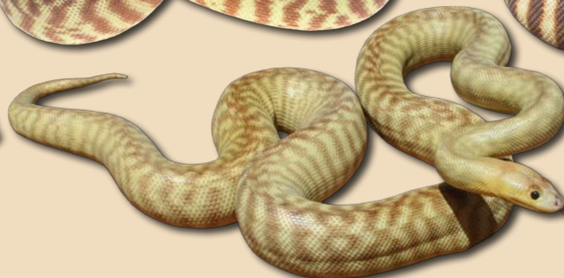
(left) As you travel further south through central Australia, the womas tend to grow in size and to lack the distinctive banding seen in other womas as they grow older and larger. However, they can exhibit lovely pale yellow hues and grey/fawn markings for those with an eye for natural beauty. Shown here is picture of womas from the Moomba area of SA.