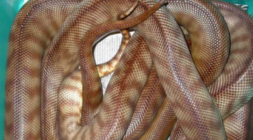
Tanami womas mating. They don't mate for anywhere near as long as carpet pythons and so you need to keep a constant eye on them to catch them actually copulating. We have found that in the early evening and after a morning bask are the times when mating occurs most frequently.