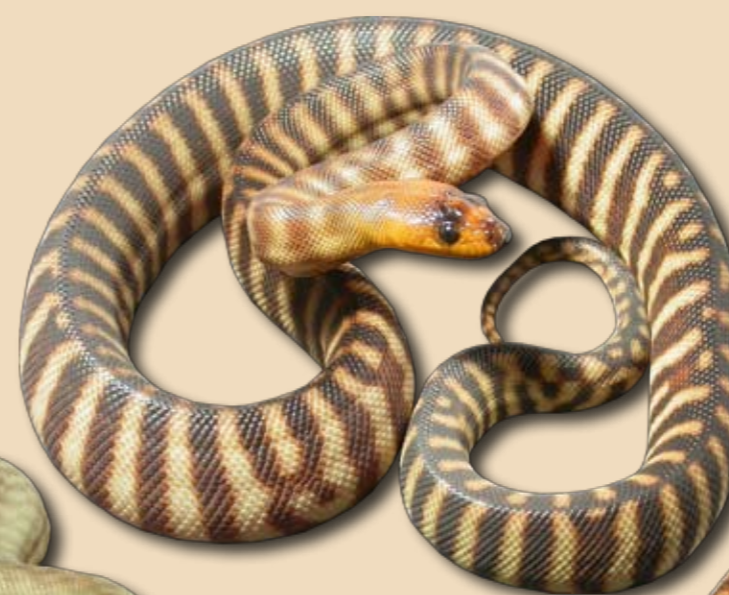
(left) These pictures of young Uluru womas show the result of selective breeding by Southern Cross Reptiles with the development of the “Charcoal” and “Orange” forms.