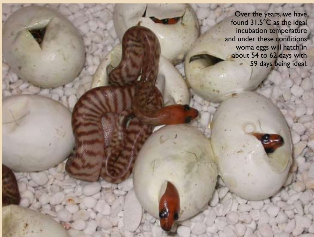
Over the years, we have found 31.5°C as the ideal incubation temperature and under these conditions woma eggs will hatch in about 54 to 62 days with 59 days being ideal.